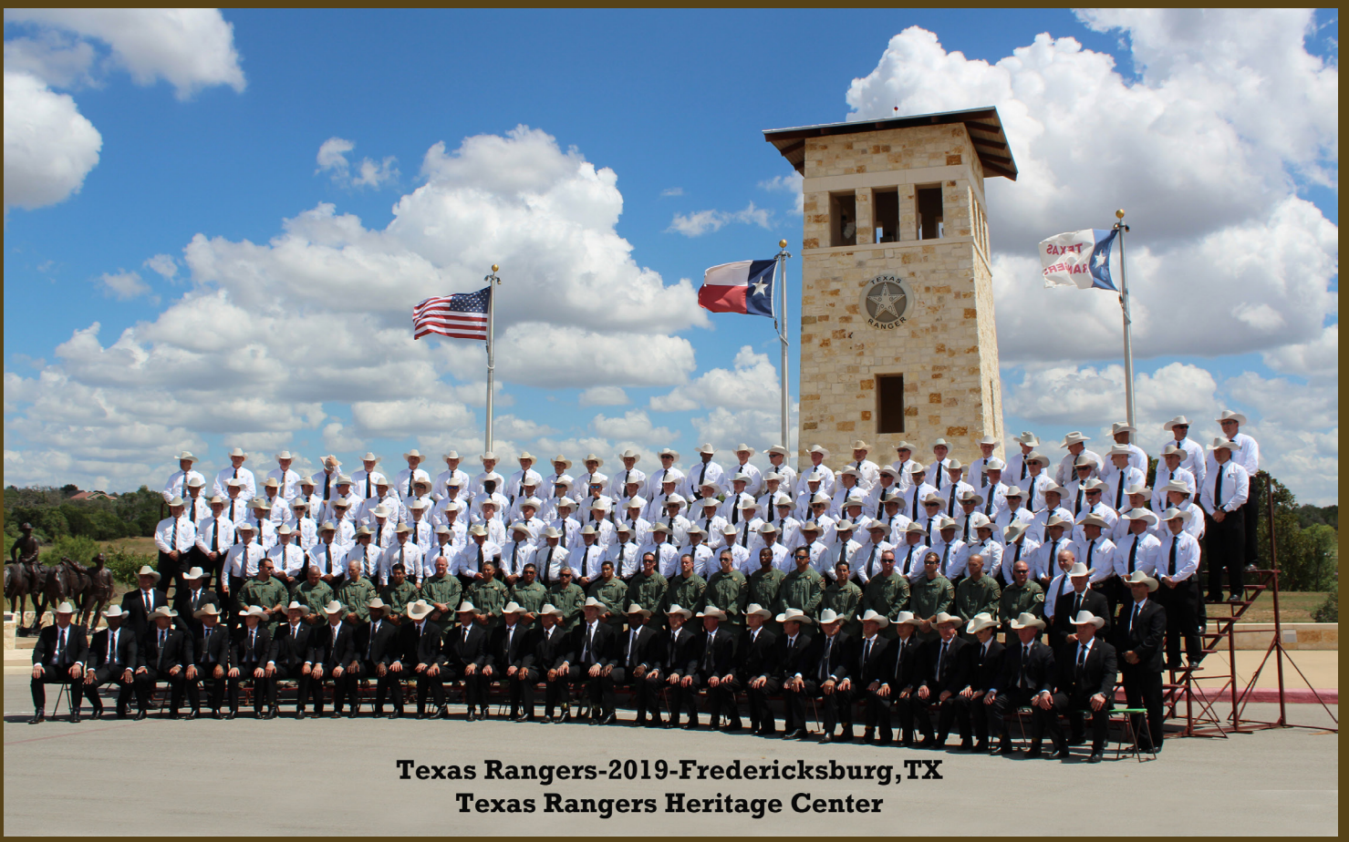
Texas Rangers-2019-Fredericksburg, TX Texas Rangers Heritage Center

SIG SAUER, INC. OF NEWINGTON, NH HAS PARTNERED WITH THE FTRF TO PRODUCE A VERY SPECIAL SIG P320 9MM HANDGUN, AS AN EXCLUSIVE LICENSED PRODUCT WITH A PORTION OF SALES PROCEEDS DIRECTLY BENEFITING THE FTRF, A 501-C3 NON-PROFIT.