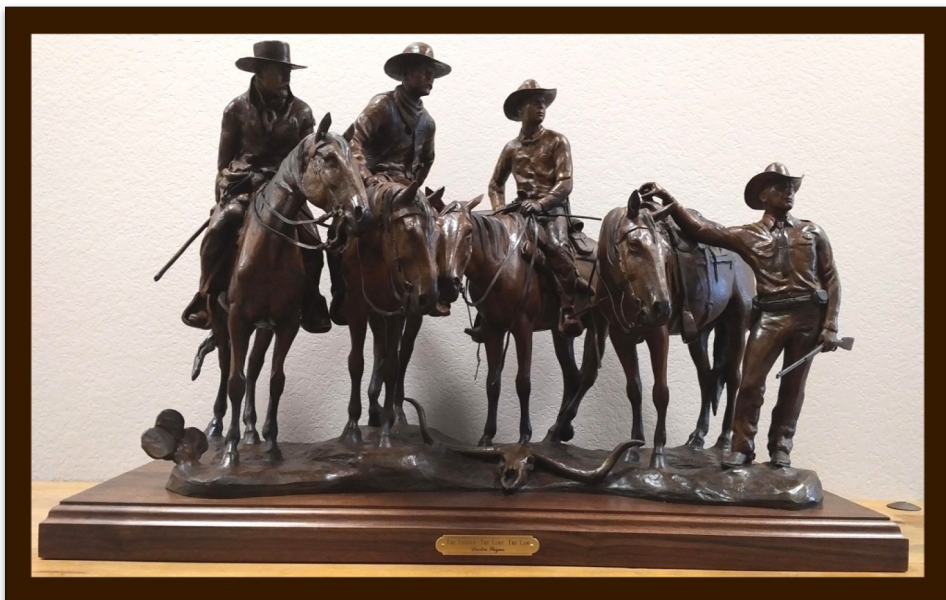
Approximately 29"L x 16"D x 20"H; base 13"D 29" x 2"H